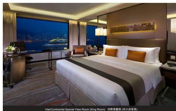
InterContinental Special View Room (King Room)