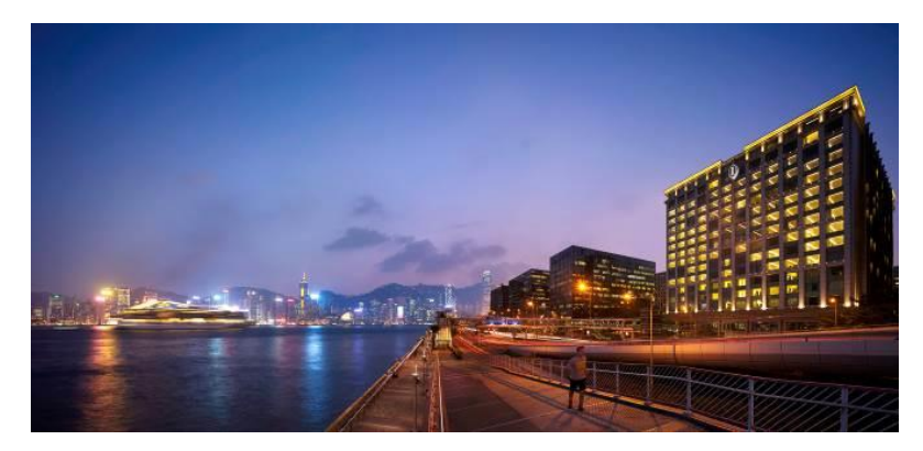
InterContinental Grand Stanford Hong Kong