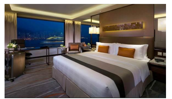
InterContinental Special View Room – King Room