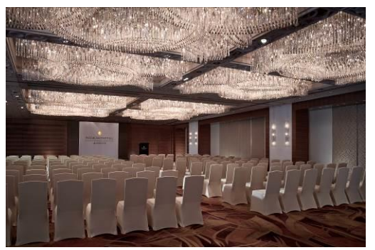
Academy Room - Theatre Set-up