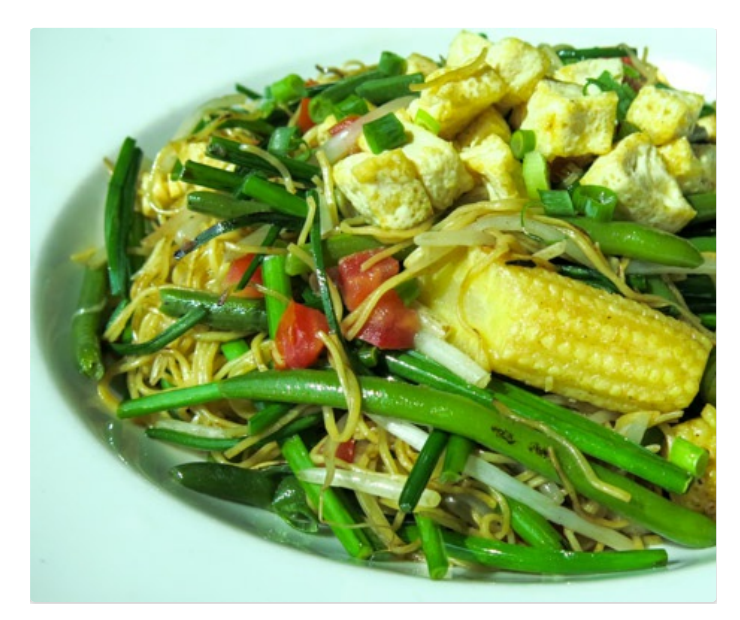
Helpful staff created tasty dishes that were free from any animal products.

Luckily for us the staff at the InterContinental Grand Stanford pulled out all the stops and made giant bowls of fried rice with tofu or vegetable and tofu laden noodles.