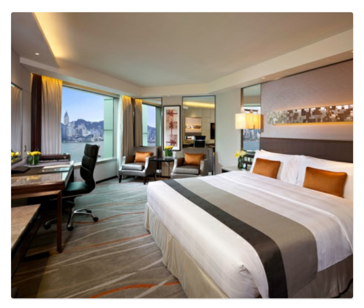
A comfortable room with a view, fully equipped with everything we needed.

Our InterContinental Sea View Room, as the name suggests, provided captivating views of Victoria Harbour and Hong Kong Island. It was fully equipped with a 46 inch LED TV, high-speed internet, BOSE sound system and even a complimentary smartphone, loaded with useful information for sightseeing. There was an easy to use coffee machine, fully stocked mini-bar and a desk to work at if needed.