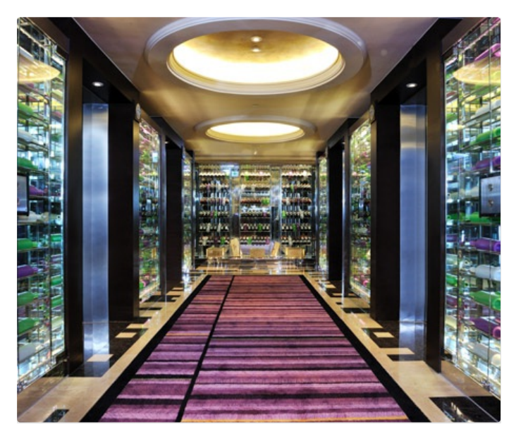
The entrance to 'Café on M', the hotel's main restaurant where we ate breakfast.

Our room type gave us the choice of eating in the Club InterContinental or heading down to the main restaurant, 'Café on M', for breakfast. We ate in both, enjoying Western and Asian favourites alongside steaming pots of green tea and coffee as well as a whole variety of fruits, berries and freshly squeezed juices.