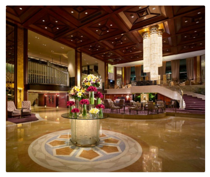
The grand lobby area with chandeliers and lavish flower displays.

Our InterContinental Sea View Room, as the name suggests, provided captivating views of Victoria Harbour and Hong Kong Island. It was fully equipped with a 46 inch LED TV, high-speed internet, BOSE sound system and even a complimentary smartphone, loaded with useful information for sightseeing. There was an easy to use coffee machine, fully stocked mini-bar and a desk to work at if needed.