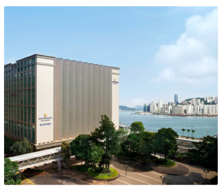
Amazing views and central location at the InterContinental Grand Stanford Hong Kong.

The InterContinental Grand Stanford Hong Kong has an enviable harbour-side location in Tsimshatsui East where transport links, shopping, restaurants and more are all within a stones throw. Enter the hotel through a grand lobby, with huge floral displays and chandeliers. At certain times of the day you can hear live piano music drifting across the air. This is a well run, multi-award winning hotel where guests visiting for business or leisure will have their needs met.