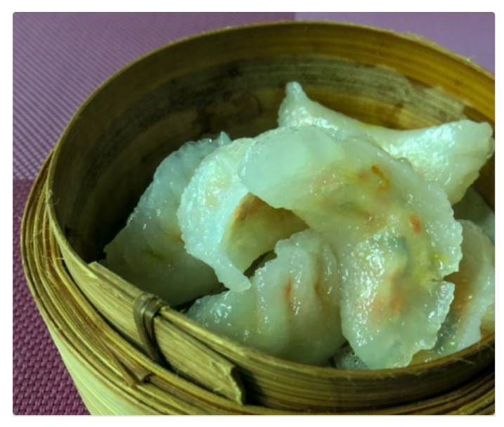
Traditional dim sum for breakfast; we loved these vegetable filled dumplings.

The helpful restaurant staff also went out of their way to make us some other dishes that were free from animal products as many of the traditional Hong Kong breakfast items had something we couldn't eat (pork, lard and oyster sauce being common non-vegan ingredients to watch out for).