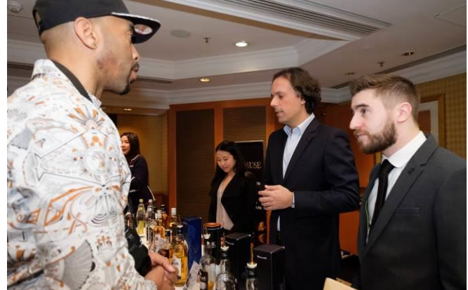
The Hong Kong Whisky Festival 2018 features more than 500 outstanding whisky expressions from over 120 brands around the globe.