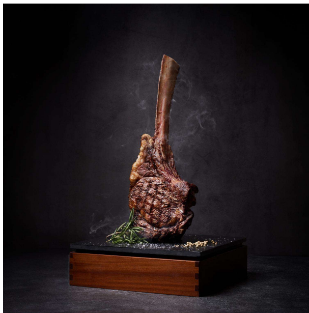
Caption: The cult steakhouse, Flat Iron Steak, will bring its signature shareable cuts to East Tsim Sha Tsui: the 1 kg Black Angus T-Bone and the 1.5 kg Black Angus Tomahawk , served in The Mistral's elegant Italian dining room overlooking Victoria Harbour.